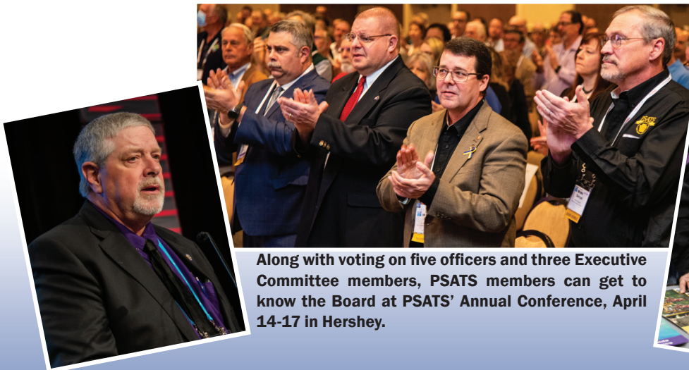
Along with voting on five officers and three Executive Committee members, PSATS members can get to know the Board at PSATS' Annual Conference, April 14-17 in Hershey.